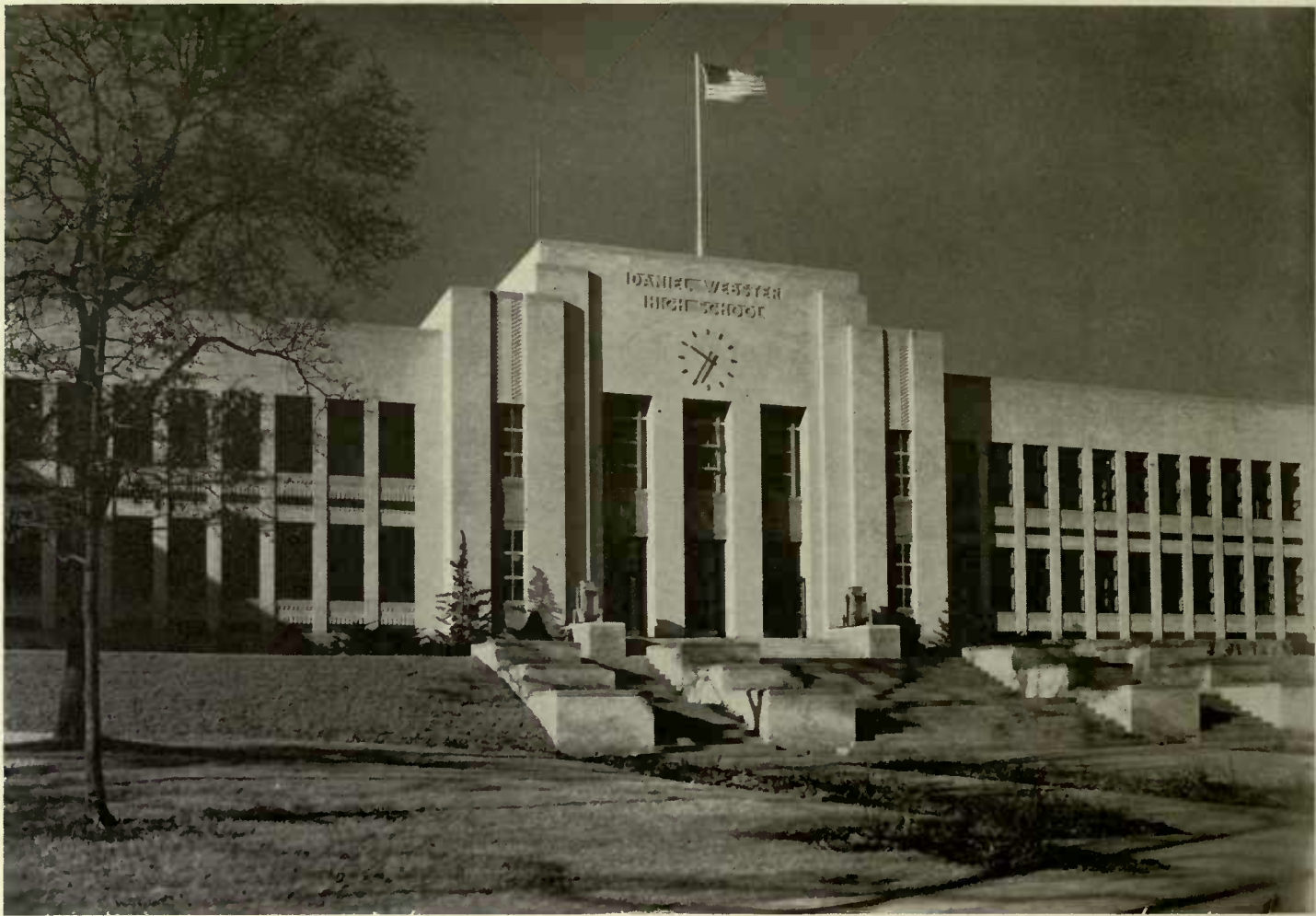
Daniel Webster High School, Tulsa, Oklahoma