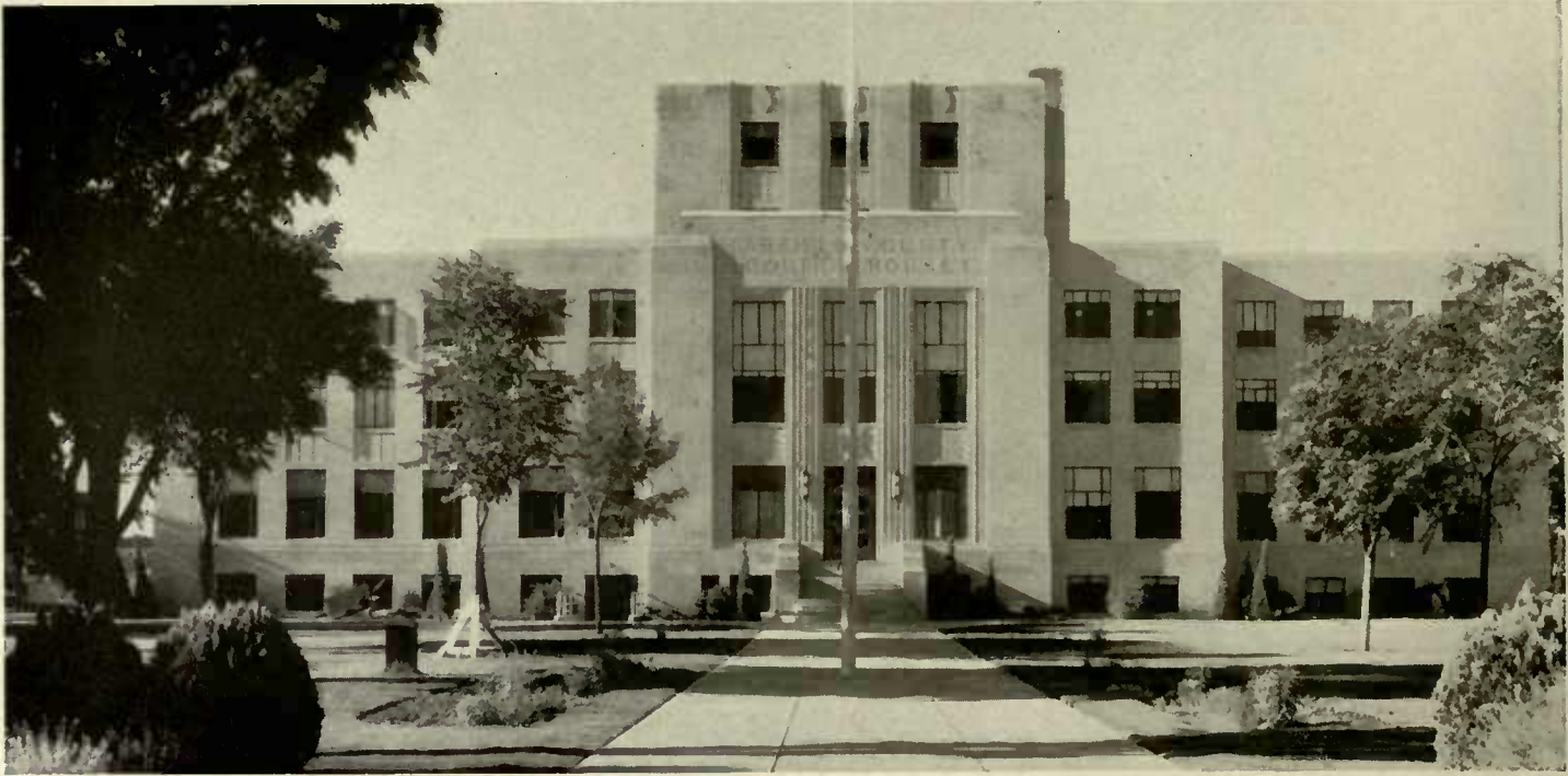
Garfield County Courthouse, Enid, Oklahoma